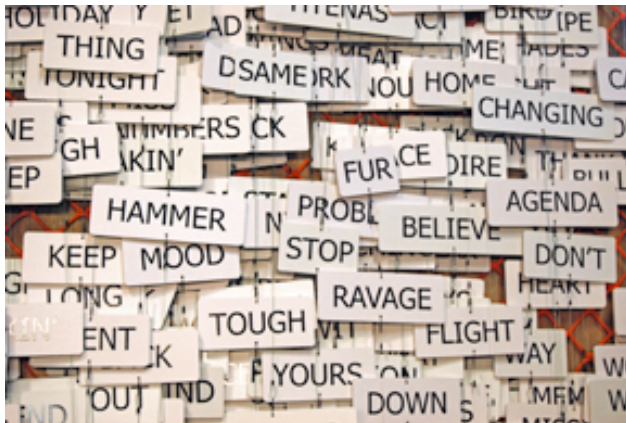
Image (left) Beniah Leuschke The Words of Every Song , 2012, steel, enamel, vinyl on Sentra and Styrene, dimensions variable (Courtesy the Artist)